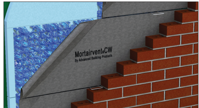
Mortairvent® CW is easy installed by simply rolling the product horizontally between the brick ties.