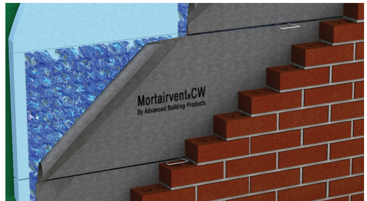
Mortairvent® CW is easily installed by simply rolling the product horizontally between the brick ties.